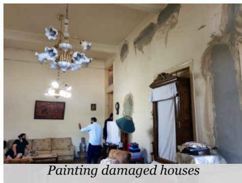
Painting damaged houses