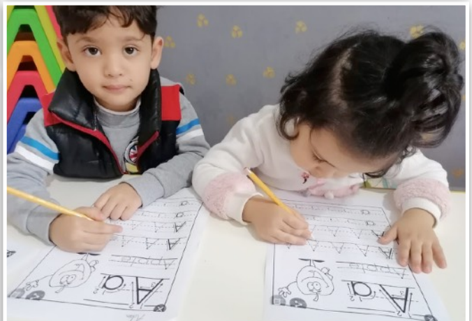
Learning the alphabets