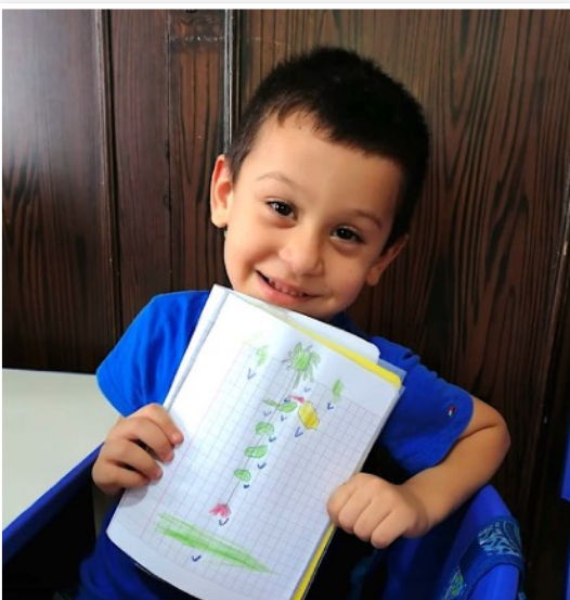
At New Vision Educational Centre