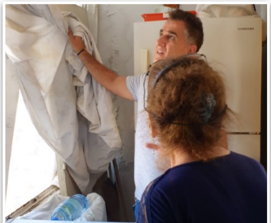
Assessing the Beirut-explosion-caused damage