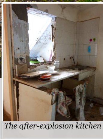
The after-explosion kitchen