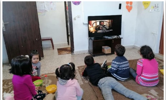
Screen-time at the centre