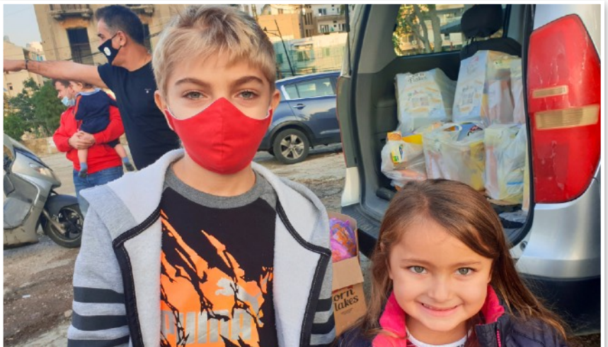
Supporting the children affected by the Beirut explosion with food packs and hygiene kits