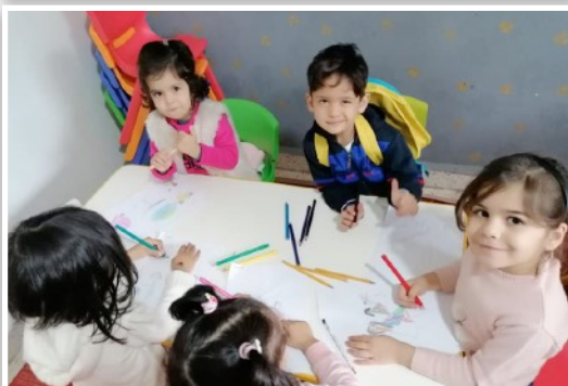
Learning to color and unleash creativity